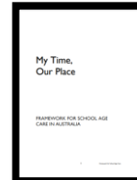
My Time, Our Place; Framework for School Age Care in Australia

Critical reflection: Reflective practices that focus on implications for equity and social justice ( Early Years Learning Framework – refer to Sources ).