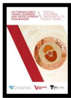
Victorian Early Years Learning and Development Framework

Approved learning framework: A document that outlines practices that educators and co-ordinators must use to support and promote children’s learning. The Early Years Learning Framework (Belonging, Being & Becoming) , the Victorian Early Years Learning and Development Framework and My Time, Our Place; Framework for School Age Care in Australia are approved learning frameworks for use in Victoria ( refer to Sources ).